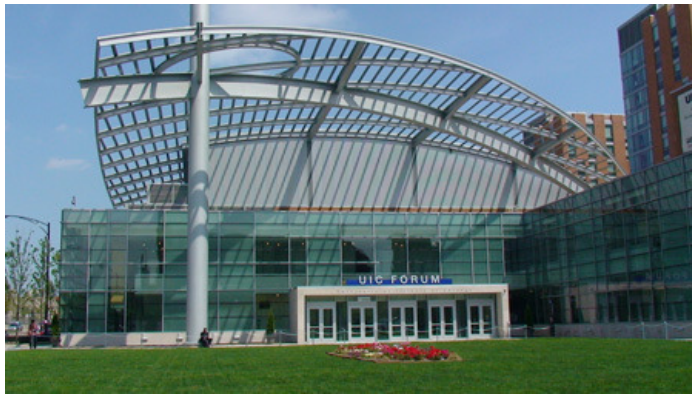
Exterior of the University of Illinois-Chicago Forum