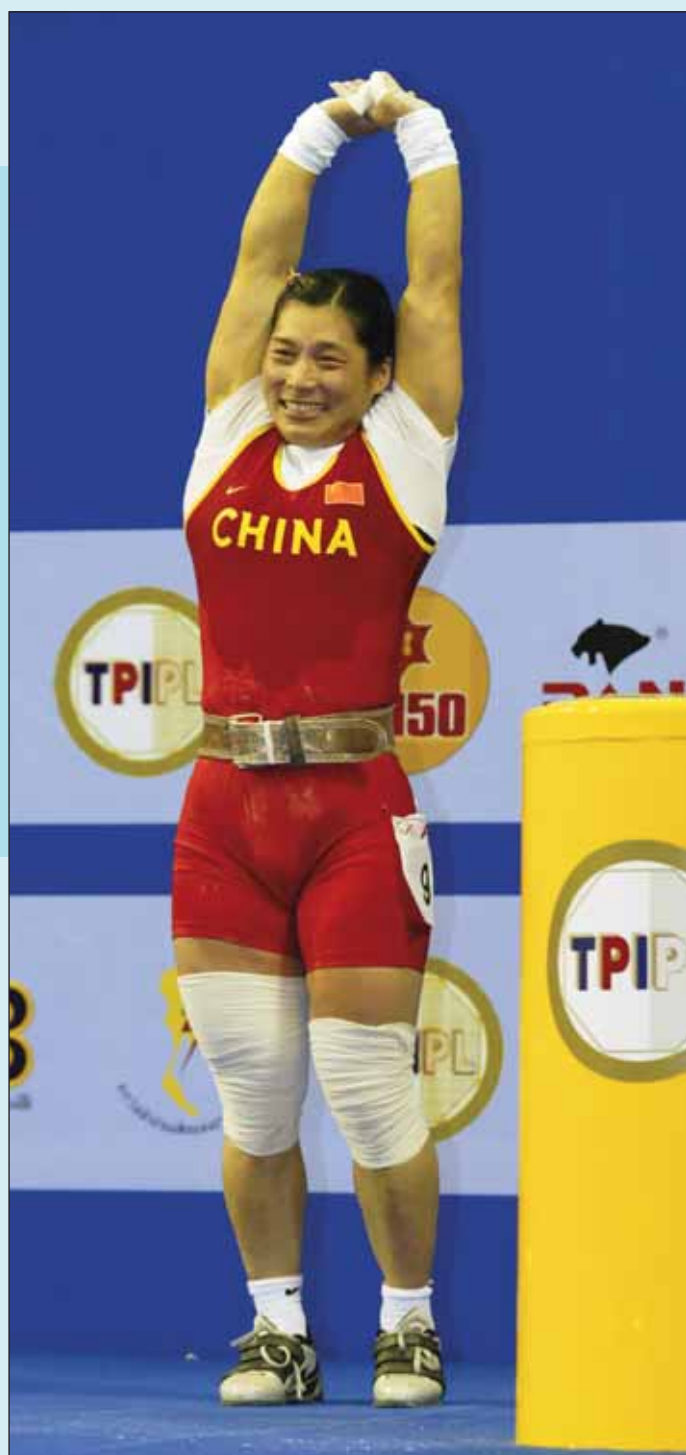
Liu Haixia CHN

taking the world title in 2007. With this accomplishment she managed to compensate for a (with Chinese standards) weaker report card of Doha, 2005, when a total of 274kg had put her “only” into second position behind Zarema Kasaeva, and where she had won the gold “only” in snatch. In the following year Liu returned to Doha; became the winner of the Asian Games with 265kg and occupied the world-ranking leader’s position, together with Evsthyukhina. For the 2007 World Championships she went down one category, the 63kg, and this move, as well as a new world record result, crowned her world champion. She is facing the challenges of 2008 with four world championship gold and two silver medals in her safe.