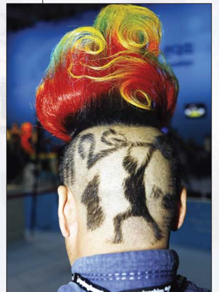
The most enthusiastic World Championships fan

rookies at senior world championships. Among the ladies, out of the 133 competitors we had seen only 28 (!) in Beijing just a year ago, while 66 of them were first-timers on the world championships platform.