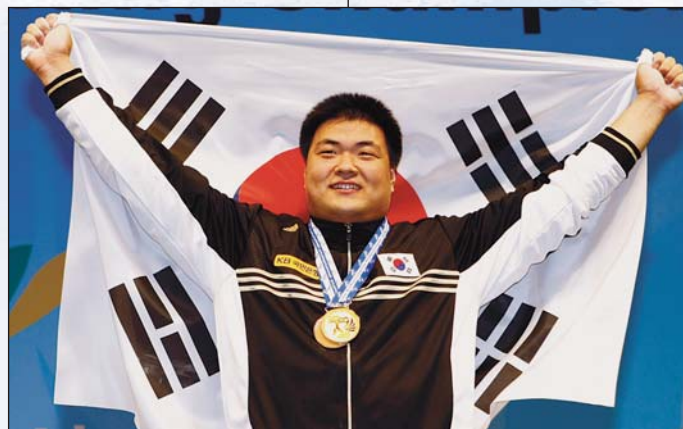
The world's strongest man in 2009: An Yong-Kwan from Korea