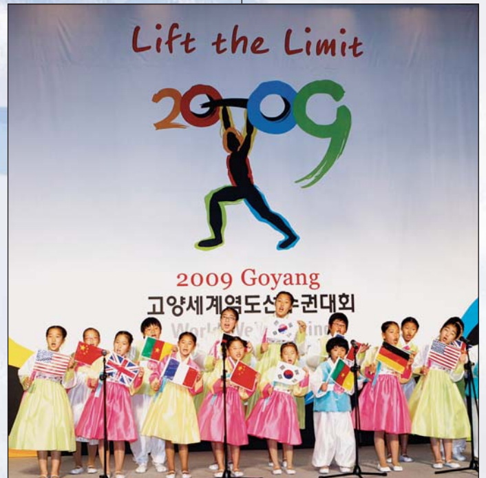
Even the ceremonies hosted by the Koreans were true to the WWC slogan "Lift the Limit!"