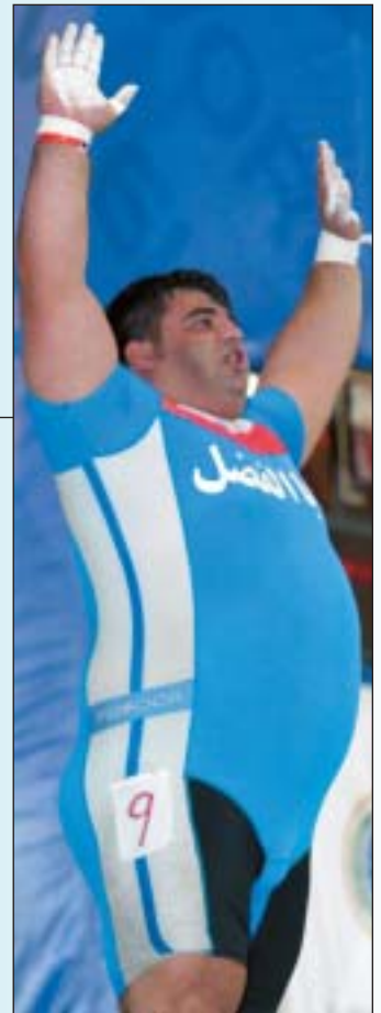
Hossein Reza Zadeh, IRI defended all his titles with ease

– Defending Olympic Champion, Chen Yanqing established 5 new world records during the 2006 Asian Games and as such, raised the bar to unpassed heights in the women's 58kg category. Ilin reconfirmed his status as favorite in the 94kg category in the